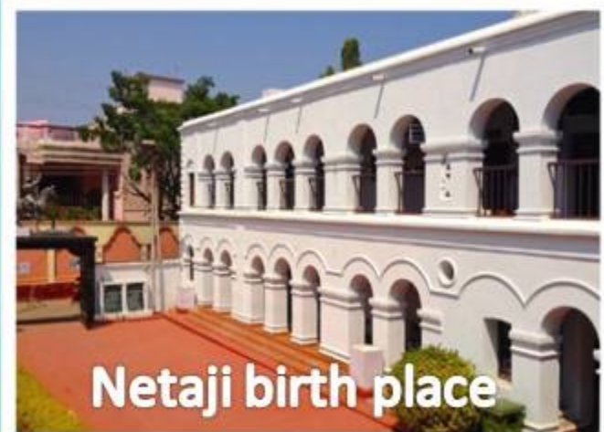
Netaji birth place