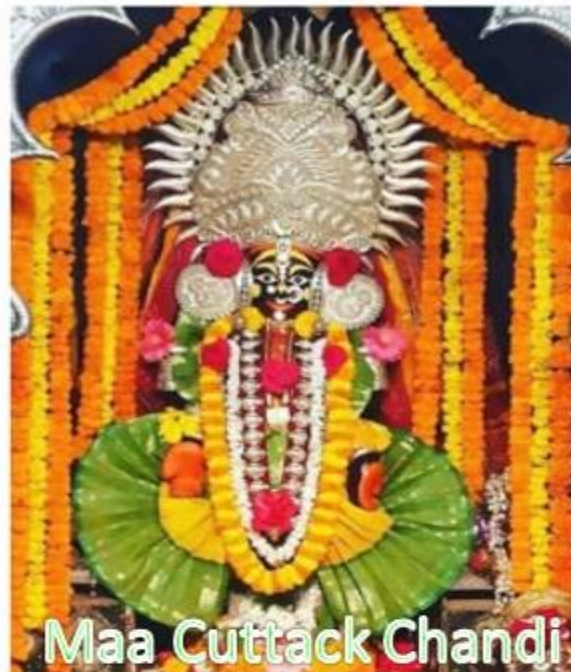
Maa Cuttack Chandi