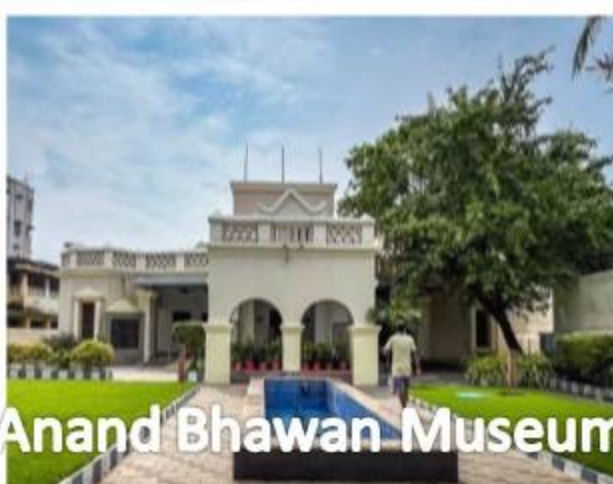
Anand Bhawan Museum