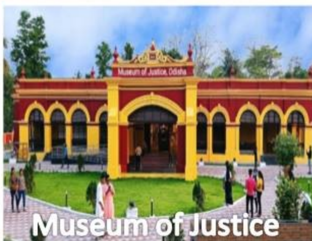
Museum of Justice